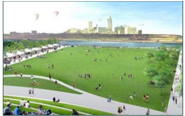
Artist's rendering of the Great Lawn area planned for the River's Edge Park.

The park will stretch just north of the bridge south to Harrah's Casino. It will feature a 6-acre "Great Lawn" where people can relax, play games or enjoy a concert with the Omaha skyline as a backdrop.